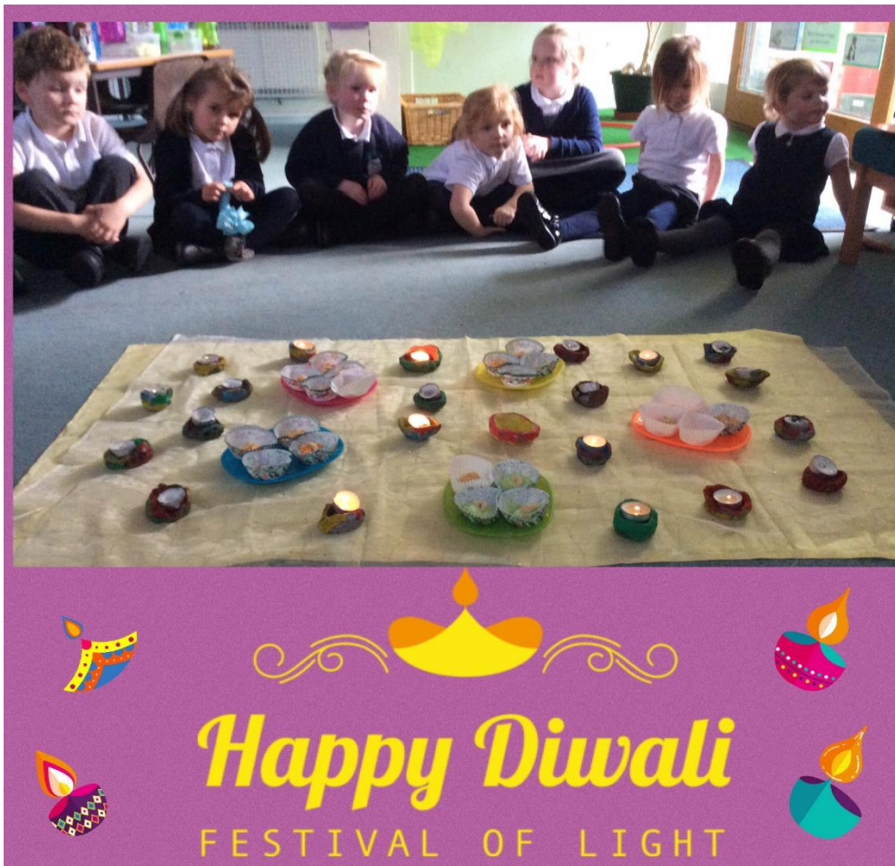
Happy Diwali from Year R. We celebrated by making diva lamps and barfi sweets.

All Parents and Carers will have recently received a link to the Dartmoor Multi-Academy Trust questionnaire via e-mail. Please take a few minutes to complete and submit your responses.