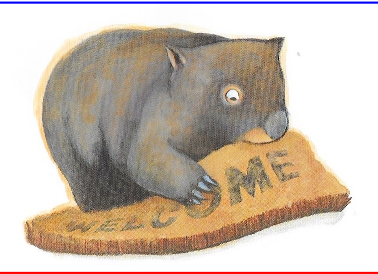
Family's point of view