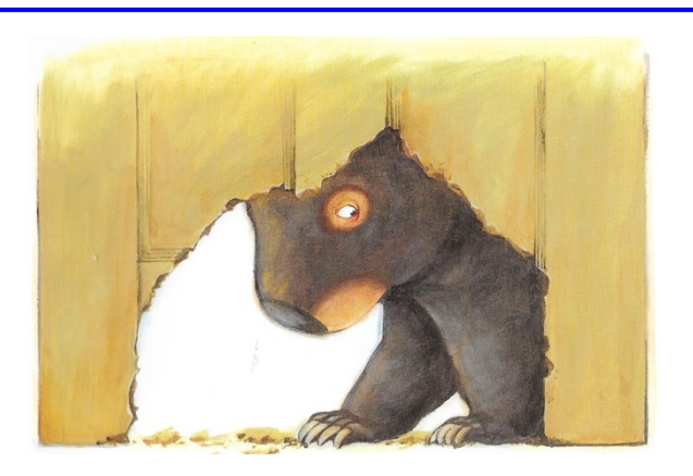
Family's point of view