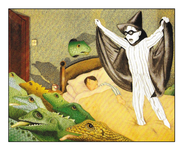
Explore more Hamilton Trust Learning Materials at <a href="https://wrht.org.uk/hamilton">https://wrht.org.uk/hamilton</a>