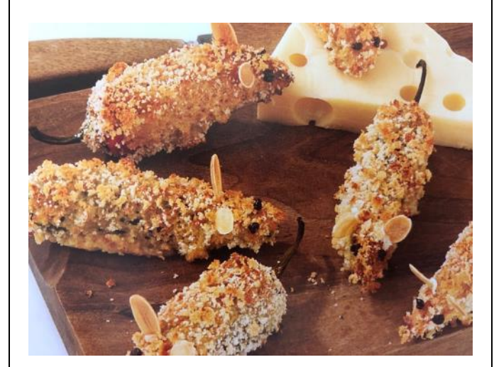
Ingredients – 2 Method - C