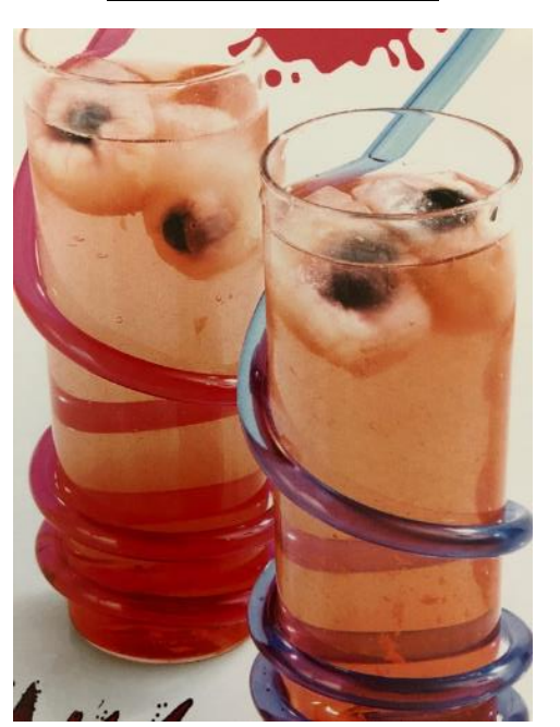
Ingredients – 3 Method - A